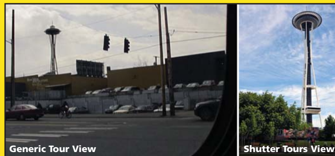
Generic Tour View